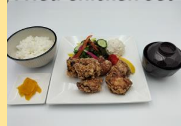
Fried Chicken Set