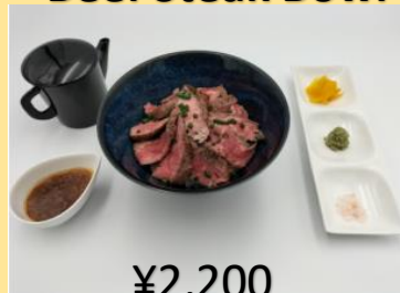
Beef Steak Bowl