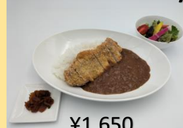
Pork Katsu Curry