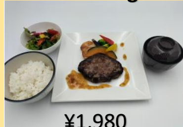
Beef Hamburger Set