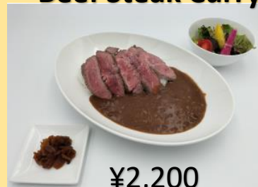
Beef Steak Curry